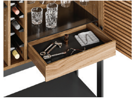
A versatile lined storage drawer can hold utensils or act as a serving tray for bottles

The smooth satin-etched glass top and lower shelf are resistant to scuffs and stains