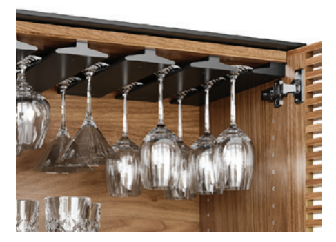
Stemmed glassware is protected with a felt-lined wooden storage rack to minimize vibration