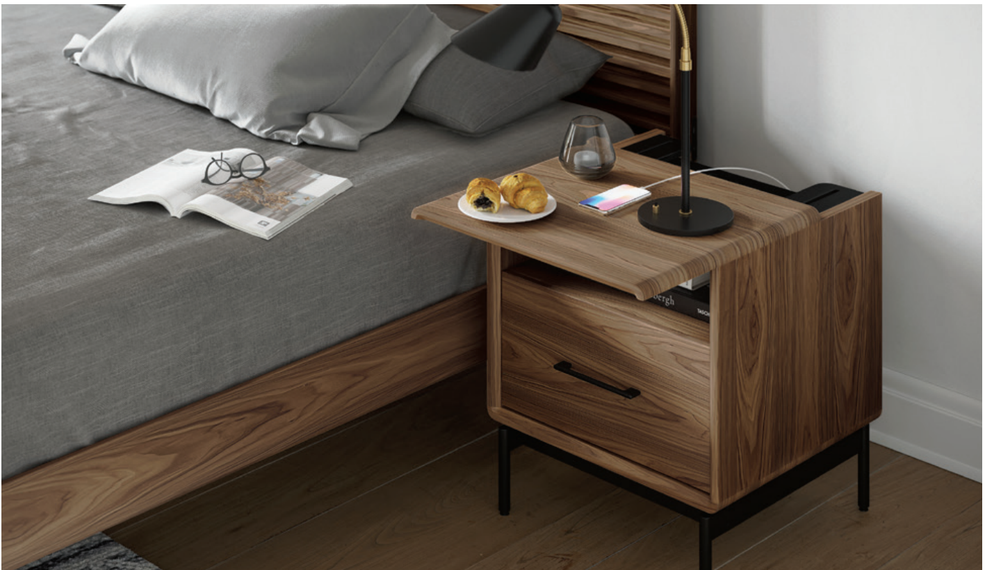
Linq 9181 22" Nightstand