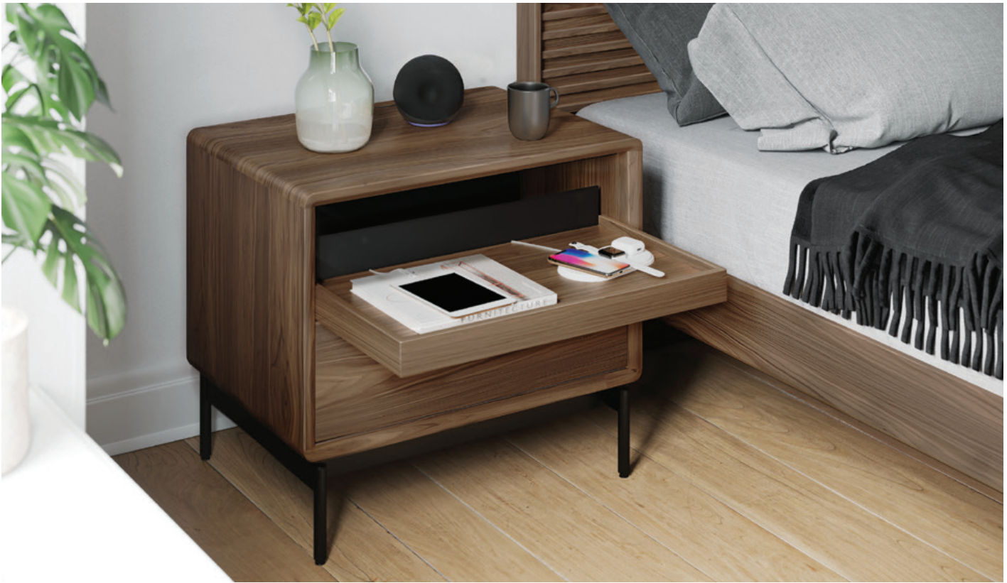
Linq 9182 28" Nightstand