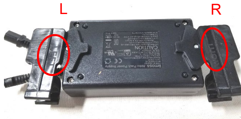
LEFT and RIGHT Bracket mounted on Battery