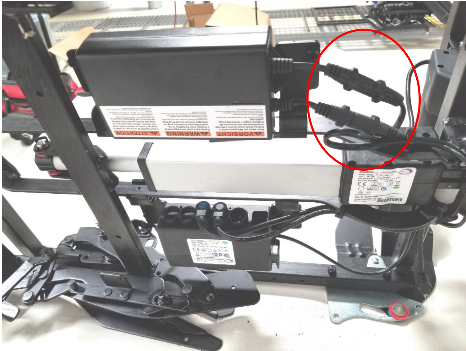
Battery snapped into place and Power Extension Cords plugged into Battery- shown from bottom of mechanism