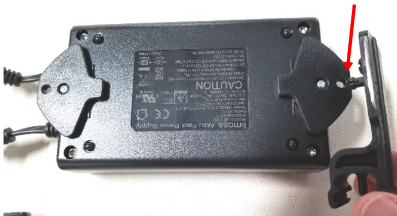
Orient Battery bottom with cords on the left. Install RIGHT Bracket on the right side and snap the fitting into the battery mounting holes as shown