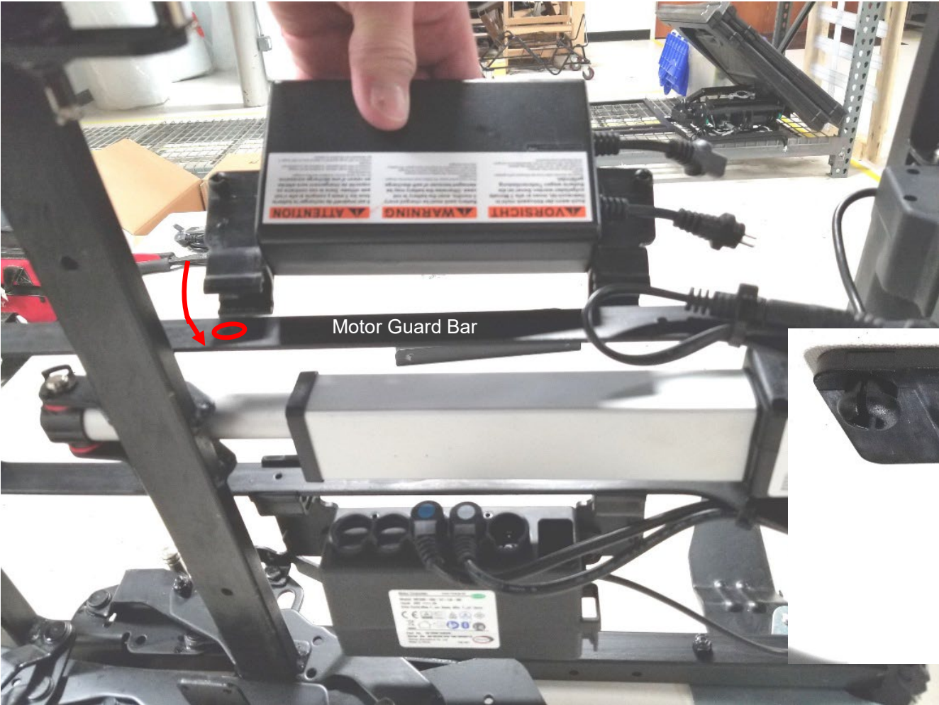
Line up Guide Pin on Right Bracket with hole in Motor Guard Bar. Hook Top Groove onto Bar and swing Battery down to snap in place