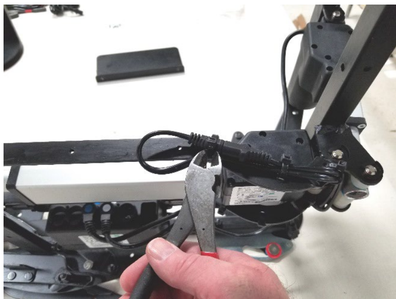
Cut Zip Tie from Power Extension Cords as shown