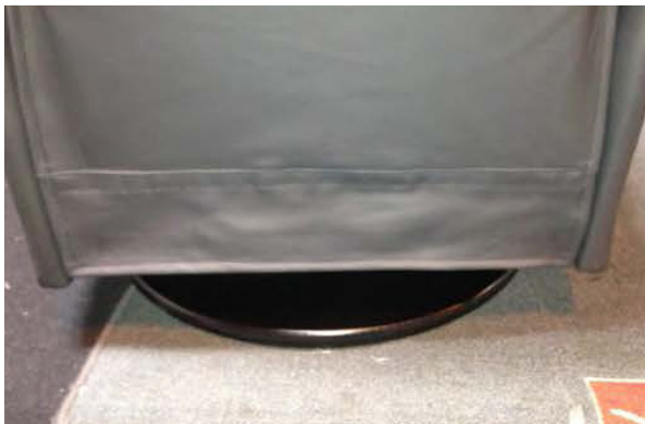
Lift up the back skirt on the back of your Swing Relaxer or Wall Saver sofa.