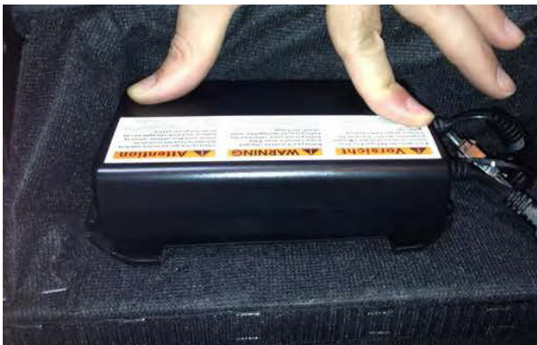
Battery snaps onto the empty plate.