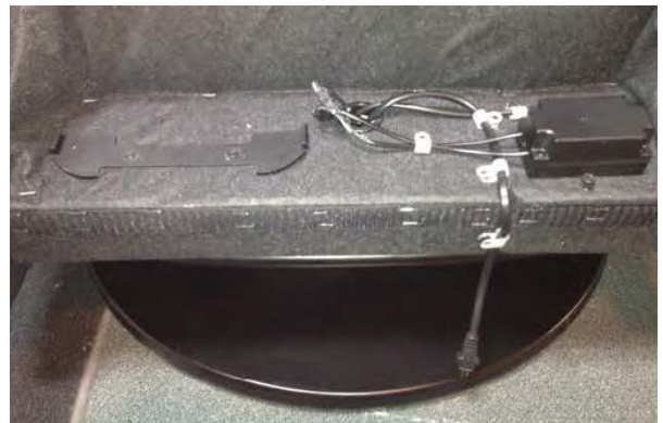
Unhook the direct power cable from the motor behind the seat.