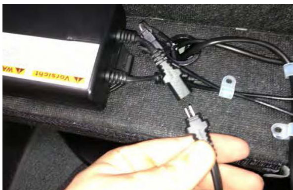
Connect free wire to battery and you have battery power.