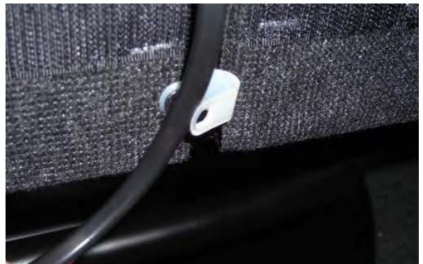
Unsnap clip to free up wire.