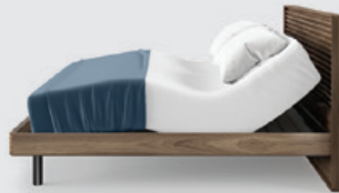
Platform Position: Low Frame Position: High Platform Height: 11 in | 28 cm (12" Adjustable Mattress shown)