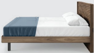
Platform Position: High Frame Position: High Platform Height: 14 in | 36 cm (10" Mattress shown)