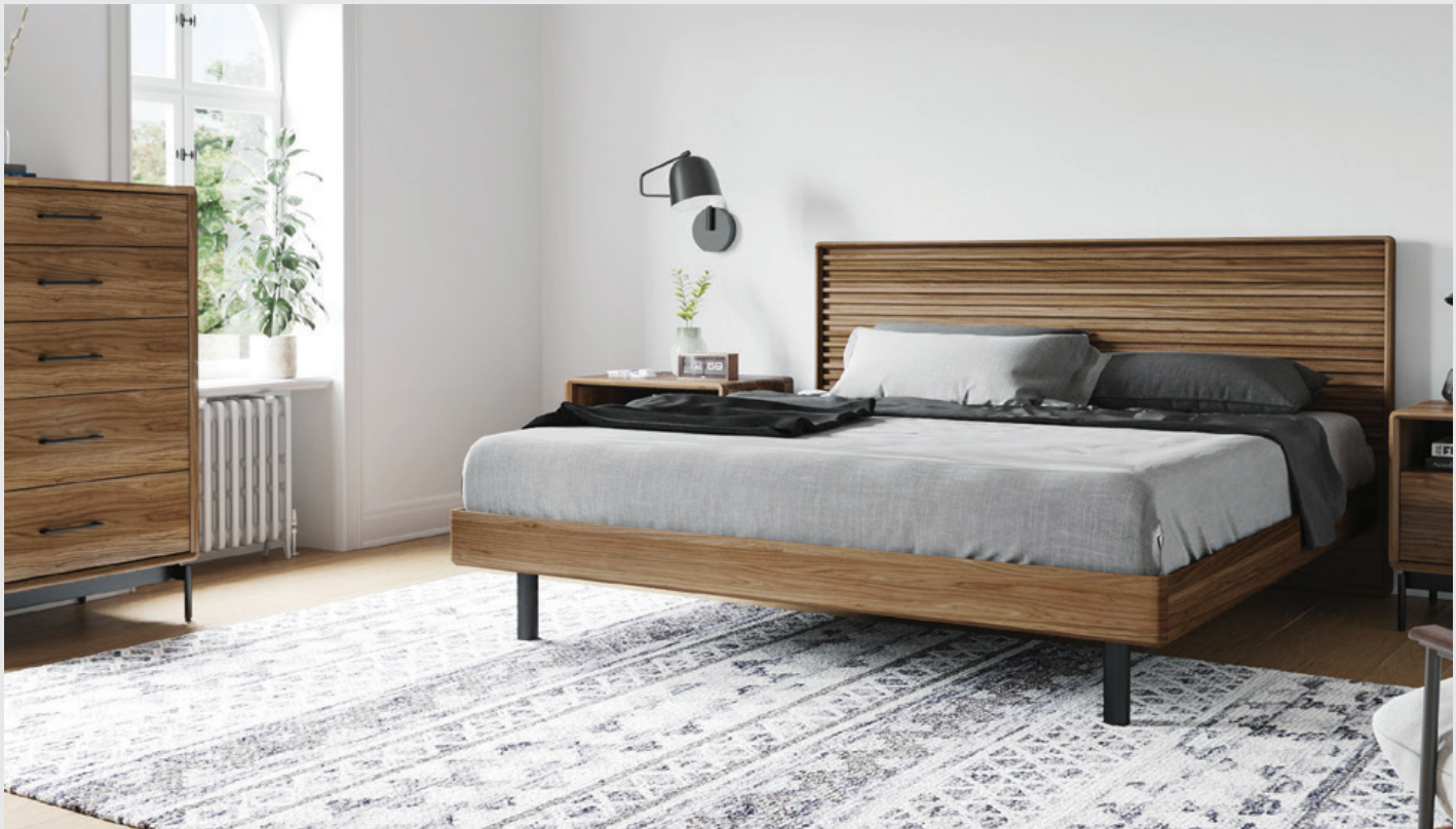
Cross-Linq 9129 King Bed with Linq Chest and 22" Nightstands