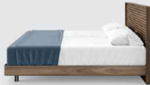
Platform Position: High Frame Position: Low Platform Height: 11 in | 28 cm (12" Mattress shown)